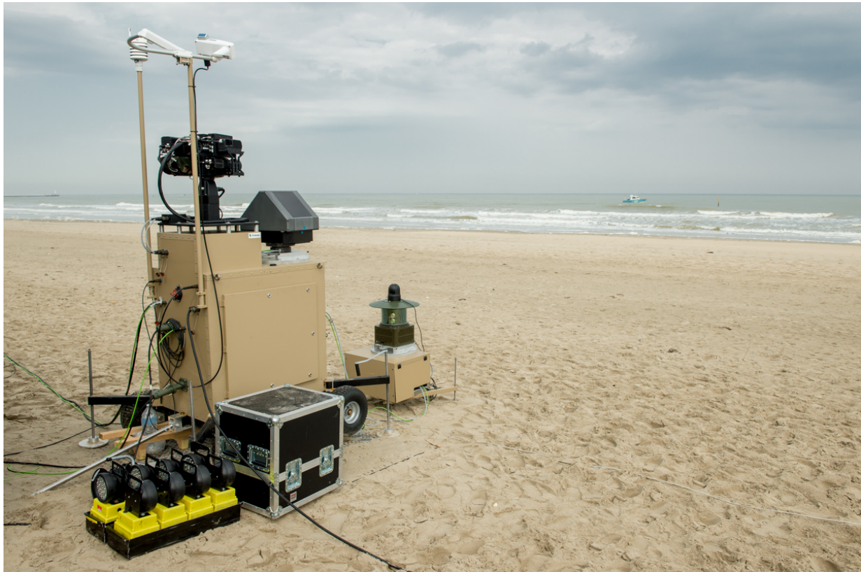
Fig. 2. SafeShore system as installed on the beach in Belgium.

and integrating qualitative and quantitative aspects in the validation process. The proposed methodology was tested on a drone detection system in the context of the EU-H2020 SafeShore project and allowed the project participants (a heterogeneous mix of end users and platform developers) to improve the performance of the system on a daily basis during operational field tests of the system, thereby proving the value of the proposed methodology.